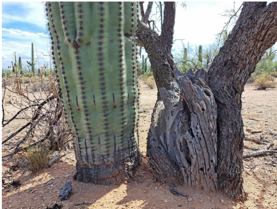
Two plants with linked histories, east of the Visitor Center.

Nature and humankind are intimately intertwined at Sabino Canyon. If we hope to understand this fascinating place, we must always remember the people who are part of its story.