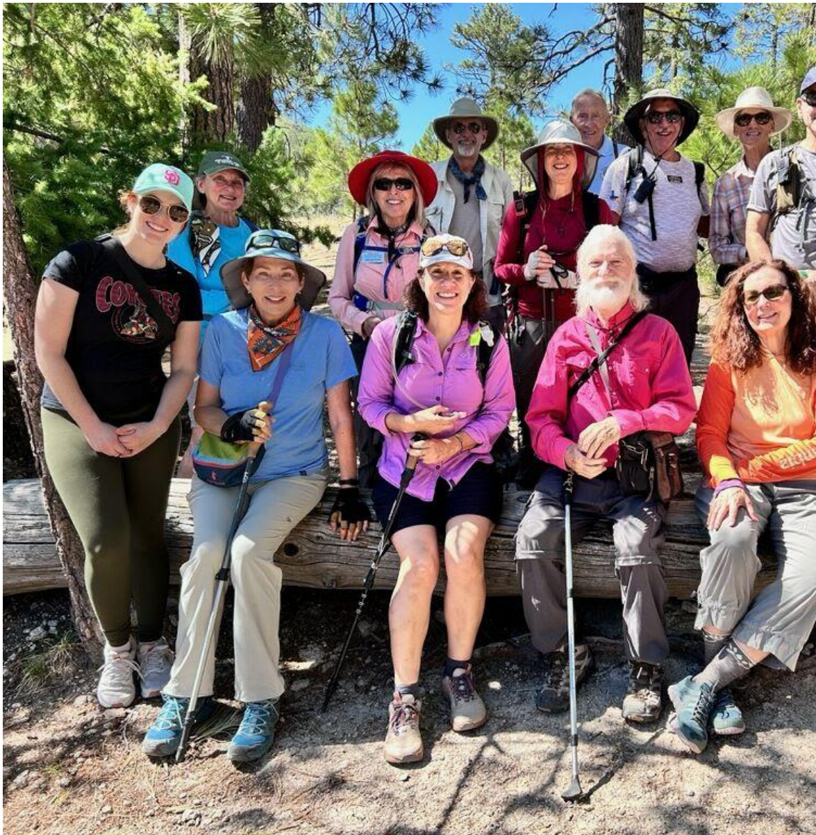
One of last summer's Mt. Lemmon hiking groups taking a lunch break at Marshall Saddle.

Click here for a printable list of this summer's Mt. Lemmon Friday hikes, complete with details. Put the list on your fridge and join in! The first hike is June 5.