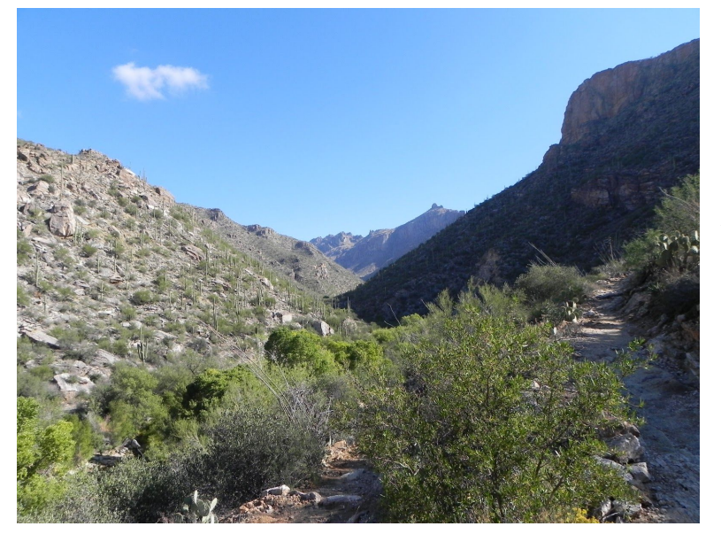
Habitat: The area in which an animal or plant lives. A habitat has sufficient food, water and shelter for an animal to survive.

Camouflage : Patterns and colors that blend in with the surrounding environment. Animals and insects may have camouflage markings to help them remain hidden in their surroundings.