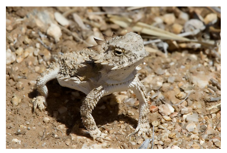
Insectivore: An animal that eats insects such as the regal horned lizard.

Mica, Garnet, Quartz, Feldspar, Magnetite: These are the five minerals found in the Catalina Gneiss rock in Sabino Canyon.